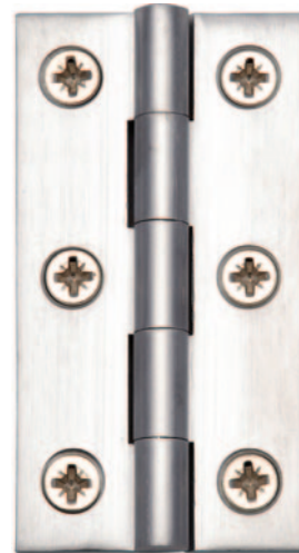
Incorporating Brass Hinge Pin

② Dimensions: see the outlines given above